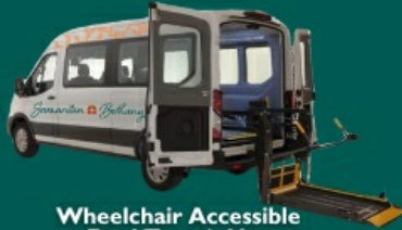
Wheelchair Accessible Ford Transit Van

Help us reach our goal to provide the residents with a new transportation option!