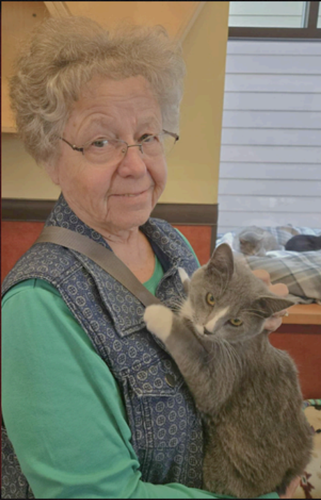
CANVA STORIES 0228:20 CNVFM 200 PLUS 08