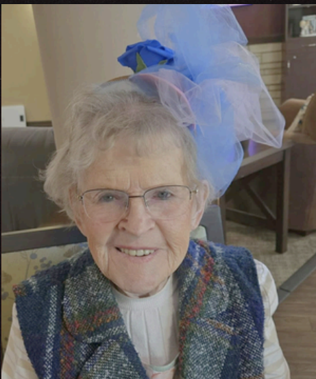
CANVA STORIES 0228:20 CNVFM 200 PLUS 08