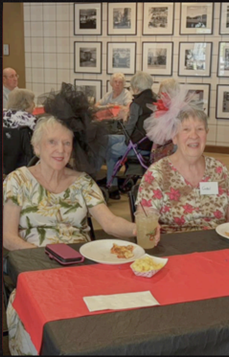
CANVA STORIES 0228:20 CNVFM 200 PLUS 08