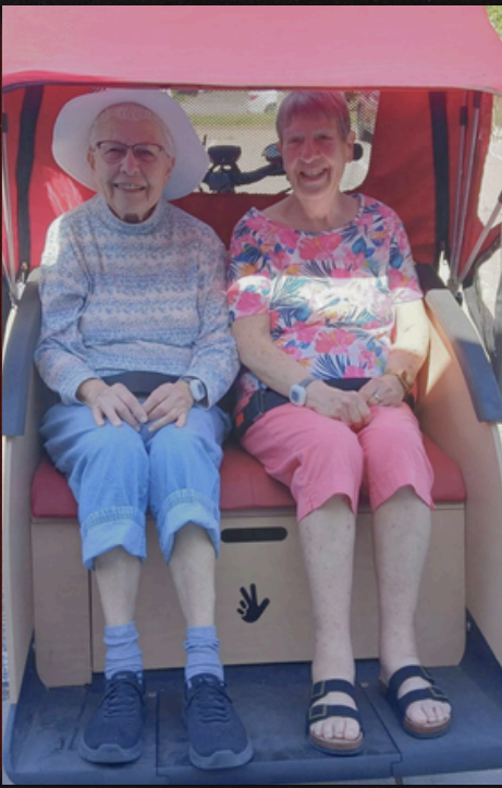
CANVA STORIES 0228:20 CNVFM 200 PLUS 08