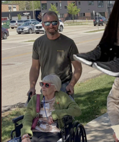
CANVA STORIES 0228:20 CNVFM 200 PLUS 08