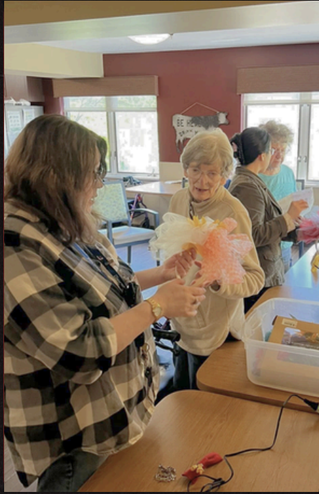
CANVA STORIES 0228:20 CNVFM 200 PLUS 08